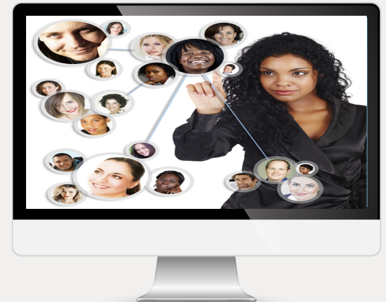
Healthy Social Engagement

Join in the creative community. If you have skills, resources and abilities in this area. Please reach out to us.