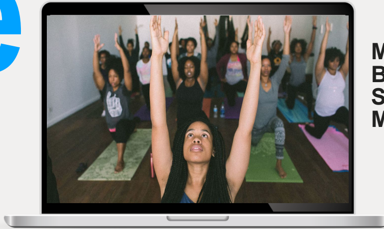
Mind Body Soul Ministry

The Ministry of Family & Community Life. A place where people are connected to each other and connected to channels of support and empowerment.