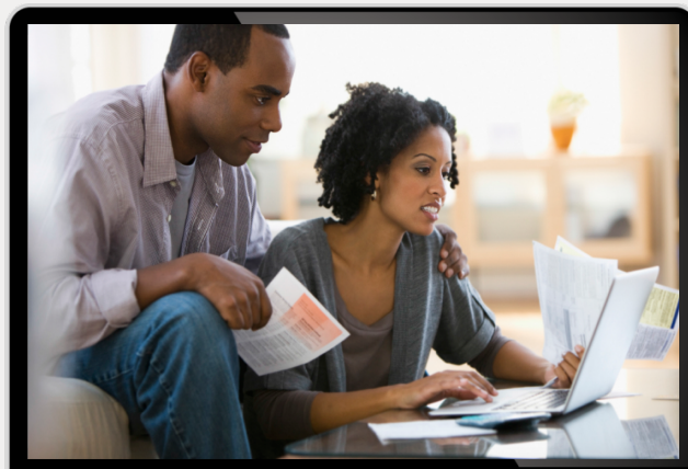
Financial Literacy Empowerment