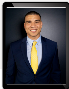
Creating Tomorrows Leaders

Join in the creative community. If you have skills, resources and abilities in this area. Please reach out to us.