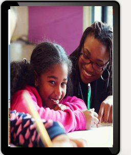
Career Mentoring for Kids