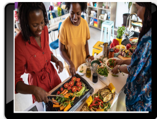
Healthy Eating Healthy lifestyle